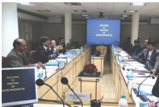
Meeting of MM-06 held at SSB Hqrs., New Delhi

Meeting of MM:06 group was held on 30-11-2011 & 30-12-2011 to discuss and finalize the Project on