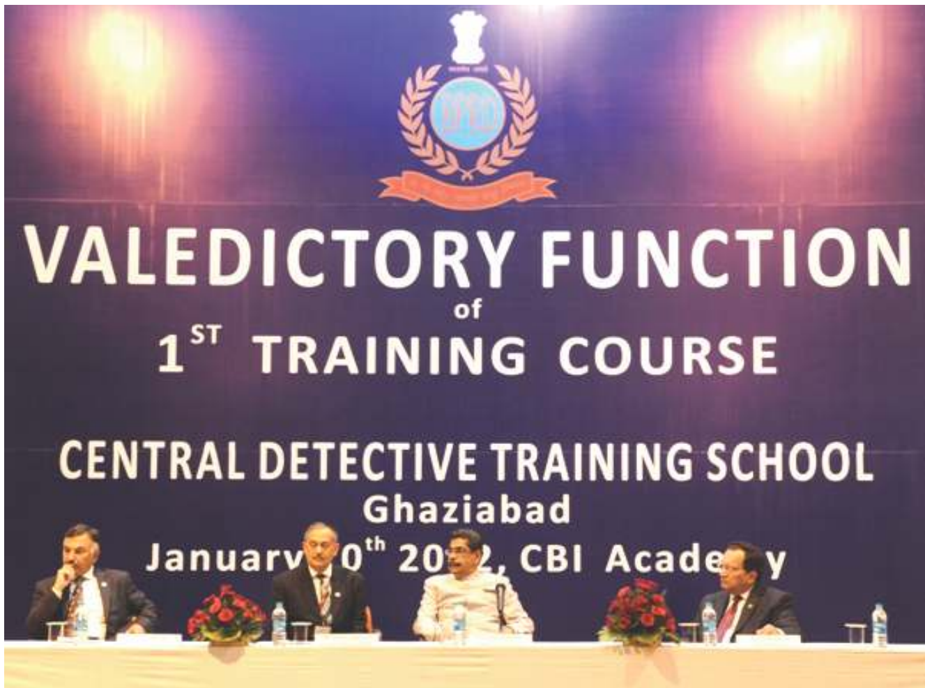
Sh. Mullappally Ramachandran, Union Minister of State for Home presiding over the Valedictory Function

BPR&D starts 1 st Training Course at newly established CDTs