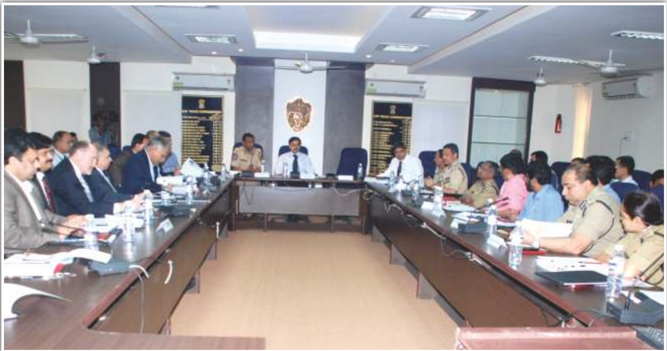
Presentation by OST being held at Hyderabad city Police Hqrs.