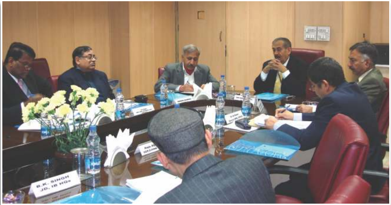
DG, BPR&D chaired the Meeting on Micro Mission-03 held at BPR&D Hqrs. on 12th January 2012

Counter Terrorism : Capacity Building at Police Station level in naxal affected areas.