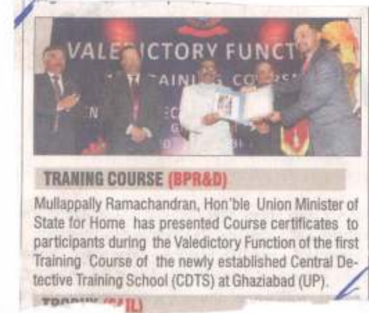
Union Minister of State for Home Mullappally Ramachandran, Hon'ble Union Minister of State for Home has presented Course certificates to participants during the Valedictory Function of the first Training Course of the newly established Central Detective Training School (CDTS) at Ghaziabad (UP).