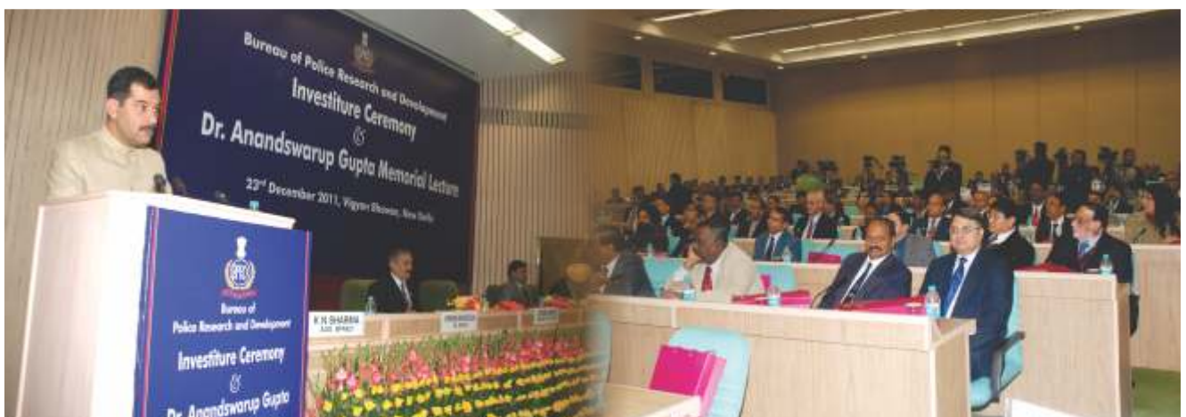
Sh. Jitender Singh, Union Minister of State for Home, addressing the gathering on the occasion