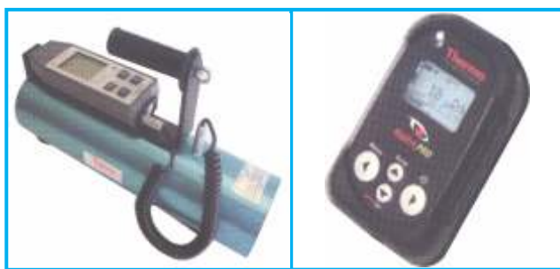
Radiation Detective Devices

BPR&D organized a presentation-cum-Demo on Nuclear Biological & Chemical Radiations Detection Device and Hand Held Banned Narcotic Device by M/s Thermo Fisher Scientific India Pvt. Ltd. The presentation/demonstration was attended by CAPFs and BPR&D officials.