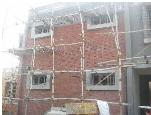
A view of Model Police station underconstruction in Punjab

Third installment of Rs. 75 lakhs to Punjab Police and 2 nd instalment of Rs. 50 lakh to Kolkata were released after obtaining the Utilization Certificate for the money disbursed earlier.