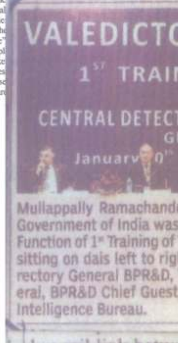
Mullappally Ramachandran, Union Minister of State for Home, Government of India was seated on dais left to right during the Valedictory Function of 1st Training Course of Central Detective Training School (CDTS) at Ghaziabad (UP).