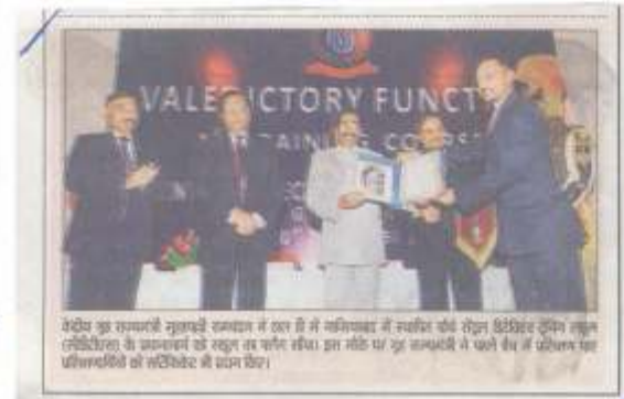
Union Minister of State for Home Mullappally Ramachandran, Hon'ble Union Minister of State for Home has presented Course certificates to participants during the Valedictory Function of the first Training Course of the newly established Central Detective Training School (CDTS) at Ghaziabad (UP).