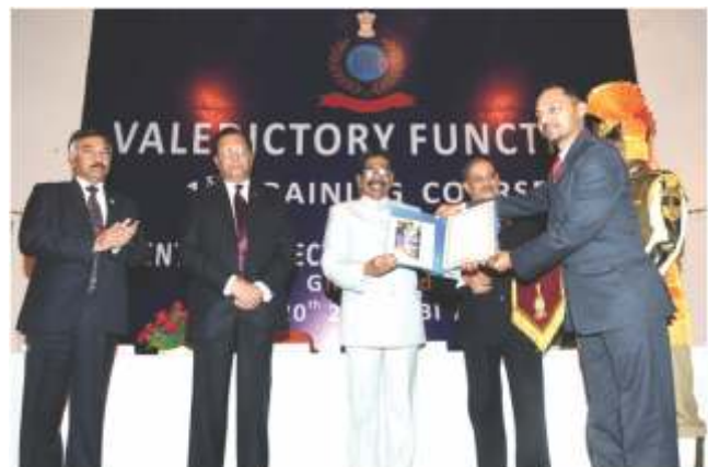
Hon'ble Union Minister of State for Home Presenting Certificates to one of the Trainees of the First Training course

investigation, so that they can keep pace with new innovations by constantly sharpening their skills by training.