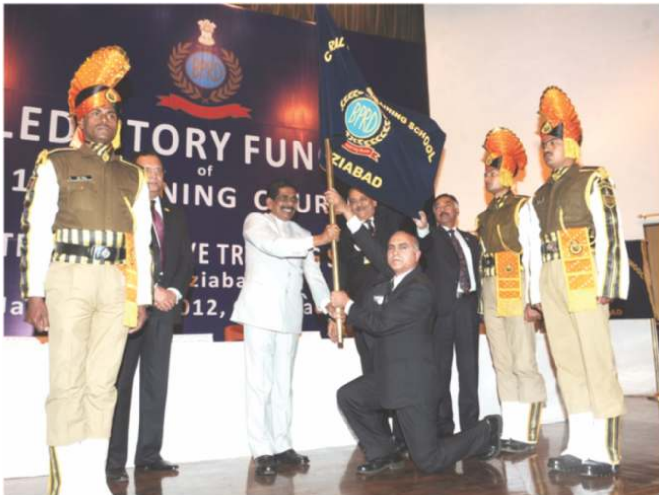
Hon'ble Minister is handing over the new flag for Ghaziabad, CDTs

The opening of CDTs at Ghaziabad is a welcome step in the field of Police Training.