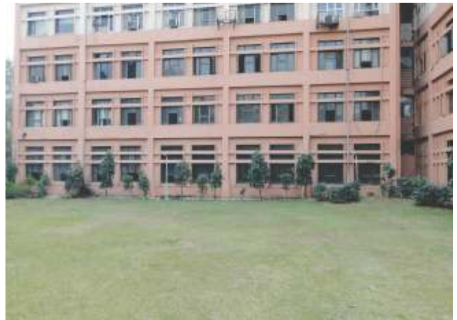
Outside view of the Building with sprawling lawn