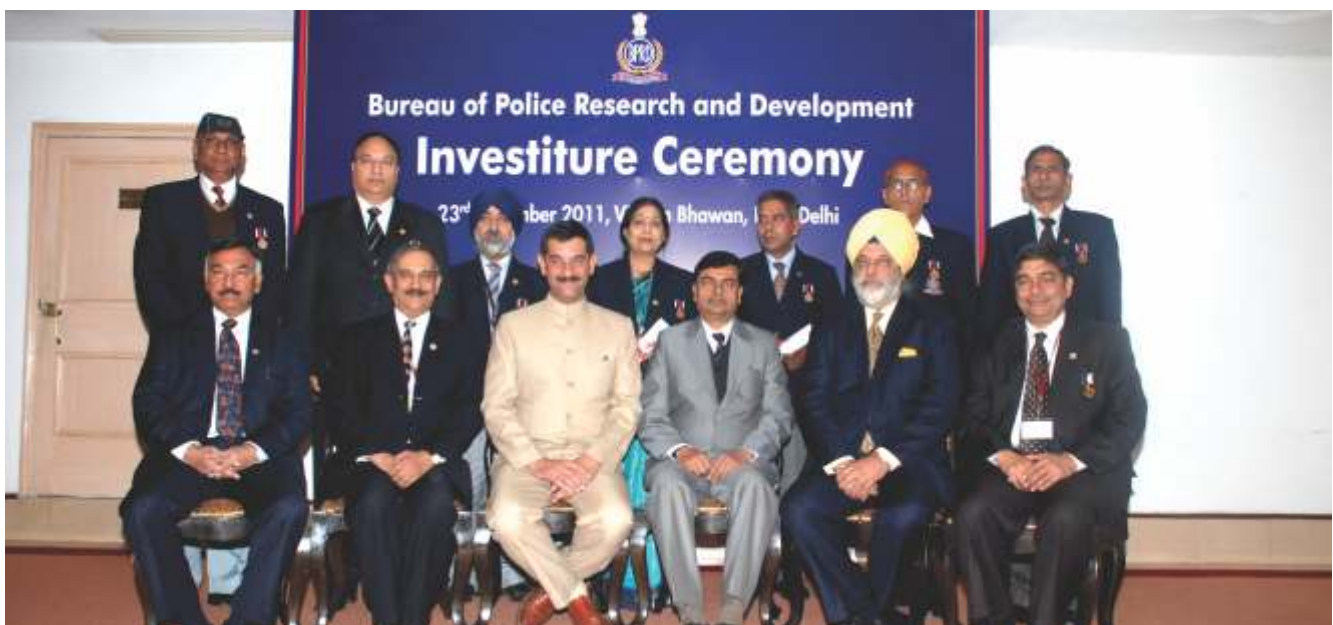
A Group photo of all the Medal Awardees with Hon'ble Minister

Shri Jitender Singh, Union Minister of State for Home in his speech highlighted the need for change in the Police. The Indian Police instead of being perceived as a symbol of fear should be seen as the